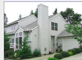
Side Exterior View

Above information is not guaranteed, but is believed to be accurate.