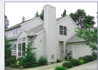
Side Exterior View

Above information is not guaranteed, but is believed to be accurate.