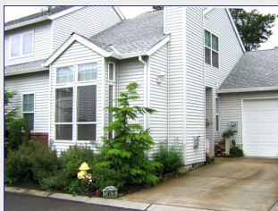
Front Exterior View

Contact Roy Widing, Principal Broker: 503-682-1083 or e-mail Roy@CertifiedRealty.com